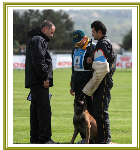
2007 FMBB World Championships, France Reporting out - Protection