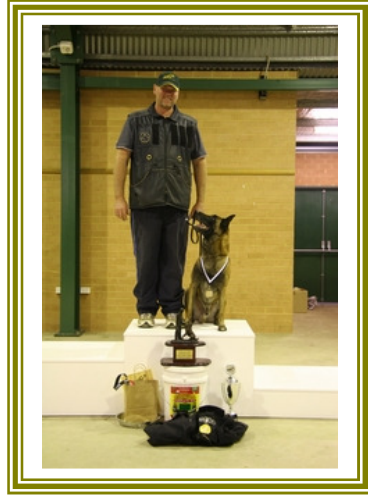
2008 AUSC GRAND NATIONAL CHAMPION

2008 was to see Bryan retire but we knew he had it in him to take out another title, so we entered him. This competition saw Bryan win the AUSC Grand National Champion Title for the second time and become a legend in Australian Dogsport as no other dog has ever won this title more than once.