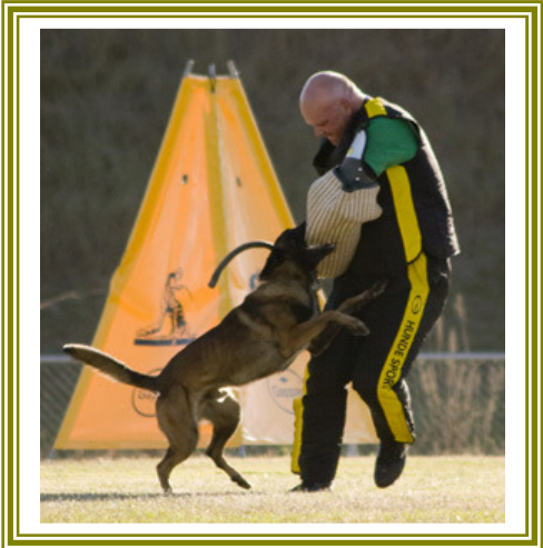
Vanrusselhof Krueger IPO 1