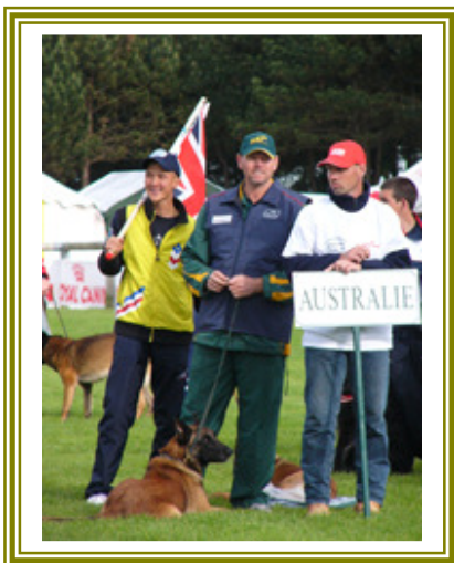
2007 FMBB World Championships, France Opening ceremony