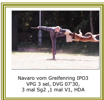
Navaro vom Greifenring IPO3 VPG 3 sel, DVG 07'30, 3 mal Sg2 ,1 mal V1, HDA

Above: Other Bryan son's in the RAAF, Police Service and Schutzhund.