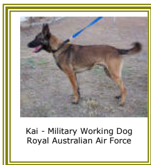
Kai - Military Working Dog Royal Australian Air Force