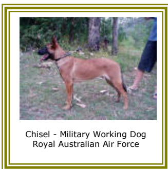
Chisel - Military Working Dog Royal Australian Air Force

Of course Bryan's sons and Daughters are not only sport dogs he has a number of sons in the Royal Australian Airforce, the Western Australia Police Service, Security & Obedience/Agility homes. That's just here in Australia, before Bryan came to Australia he was the number #1 stud dog of the world famous European Malinois kennel "Daneskjold", renowned for consistently producing some of the best working Malinois in Europe. In fact Bryan's litter brother is a police dog with the famous Nordrhine-Westfalia Police and many of his sons have gone on to have successful service and dogsport careers.