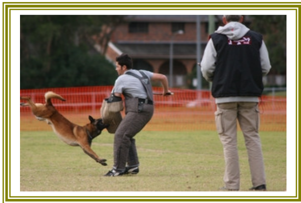
Schutzshep Dax IPO2